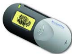
BioSIMKey Fingerprint Scanner & Plug-in Smart Card Reader